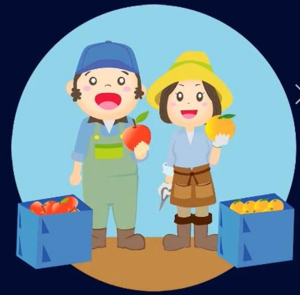
00:00:34 Teacher 🔊 🗨️